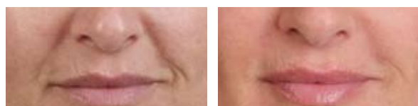
Before After 2 syringes JUVÉDERM® Ultra 1.6 mL