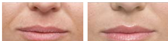
Before After 1 syringe JUVÉDERM® Ultra 0.8 mL

Common side effects with JUVÉDERM® injectable gel usually are mild or moderate. Ask your healthcare professional how to manage them.