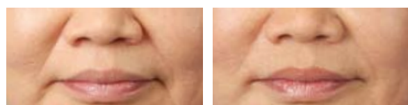
Before After 2 syringes JUVÉDERM® Ultra Plus 1.6 mL

Unretouched photographs. These photographs are not of clinical trial subjects. Individual results may vary.