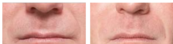
Before After 1 syringe JUVÉDERM® Ultra Plus 0.8 mL