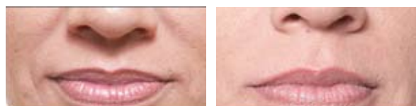
Before After 2 syringes JUVÉDERM® Ultra 1.6 mL